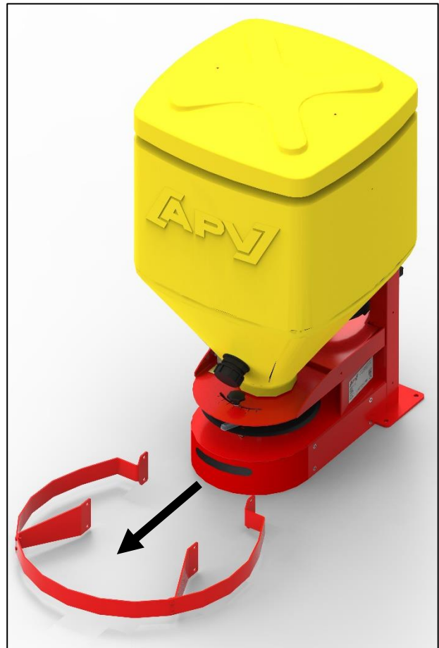
Figure 2: Removing the safety bar