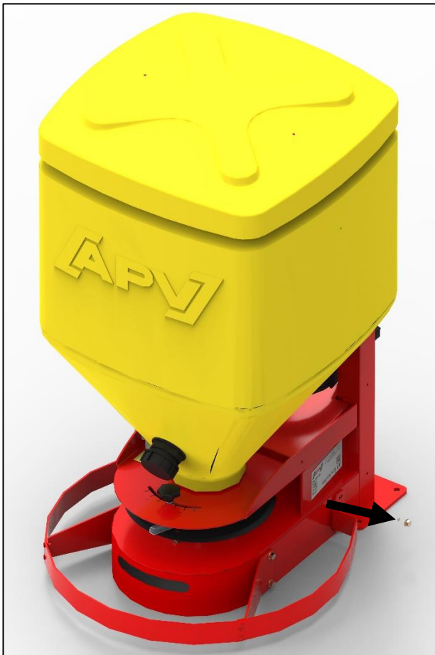
Figure 1: Removing the hexagonal bolts

Loosen the 8 hexagonal bolts (width across flats 10) and remove the safety bar, as shown in Figure 1 and Figure 2.