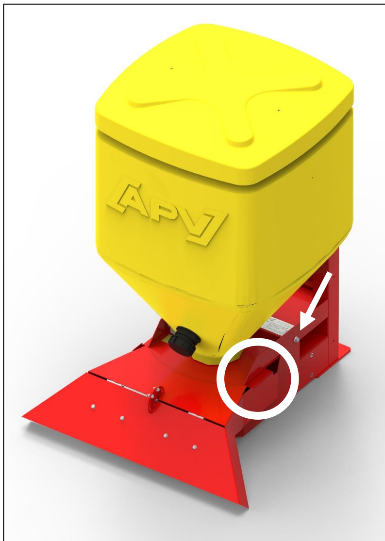
Figure 3: Installing the precision dispersion plate

If you install the precision dispersion plate on an ES 100 Special M3 or an MD (Multi-Metering System), the bolts are not yet installed on the spreaders, only the holes are pre-drilled in the frame. Here, you need the two hexagonal bolts that are included with the precision dispersion plate upon delivery.